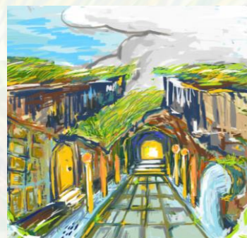
The Underground by Mamiko OTA(2020)

At the Asian Society of Human Services, We set up a place to learn regardless of the presence or absence of obstacles, and define equal and comprehensive education to be done there as Inclusive Education.