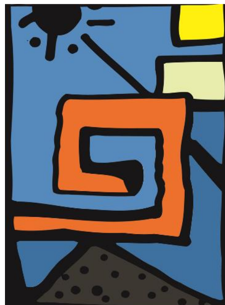
Modern Times by Yungdoo YOON(2014)

Rehabilitation is the comprehensive concept that embraces not only medical rehabilitation but also special needs education and vocational, social and psychological rehabilitations. Therefore, Asian Society of Human Services adopts the concept of Total Rehabilitation, which includes all those five scopes.